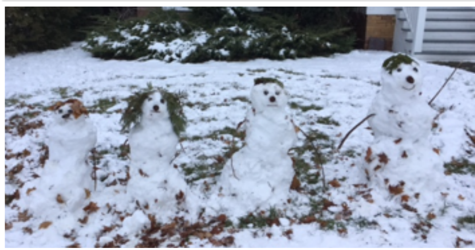
Who's who at the Parsonage?

May 2017 be filled with wonder, family, and friendship.